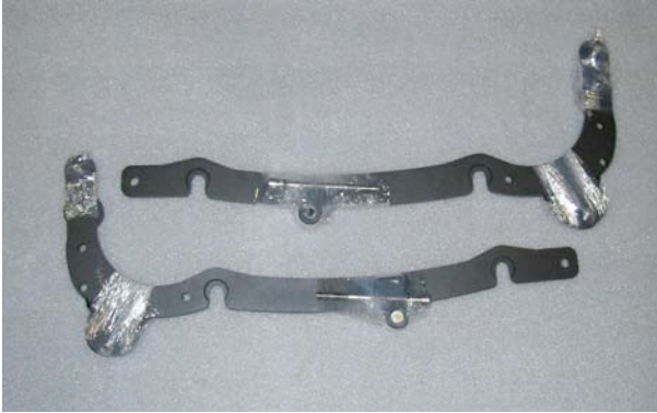
Figure 1. Main Mounts