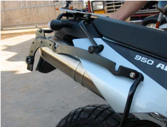
Figure 5 Main Mounts