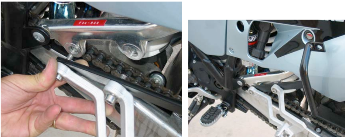
Figure 4 Left Front Mount

Installing the left front mount and main mount is the same as the right. Use 2 8x30 mm bolts. You will notice that the bag mount is positioned behind the footpeg Remember Hand Tight Only.