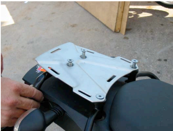
Figure 2 Rear rack plate

Set upper rear support on top of stock mount as shown in figure 3. Round spacers are placed in front mount holes