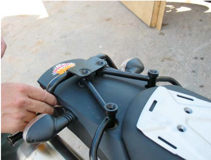
Figure 1 Upper Rear Support with spacers