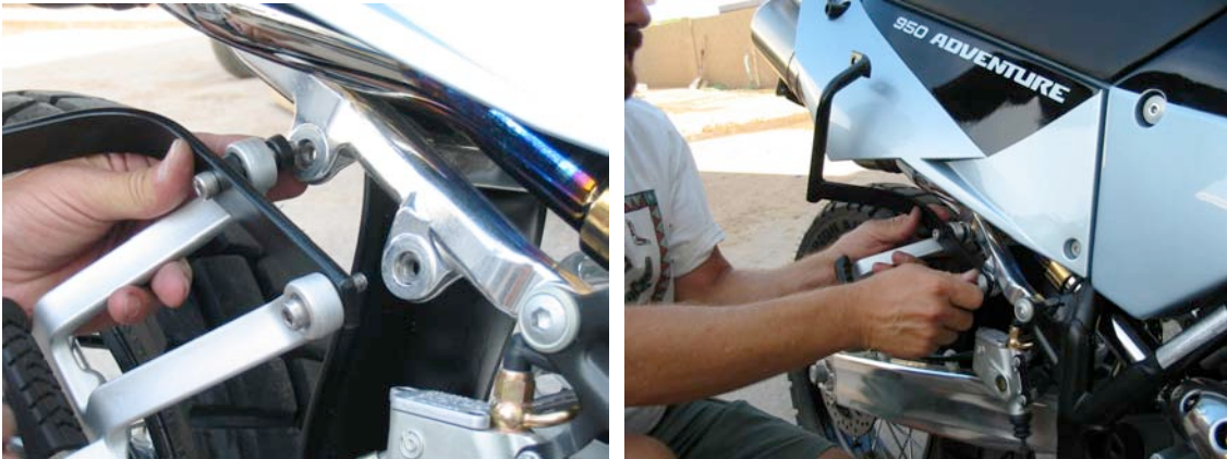
Figure 3 Right front mount

Install right Front Mount using: 1 – 8mm x 45mm with spacer, 1 8x30mm allen bolts using original footpeg mount. Use the bolts provided with the luggage. Hand Tighten only