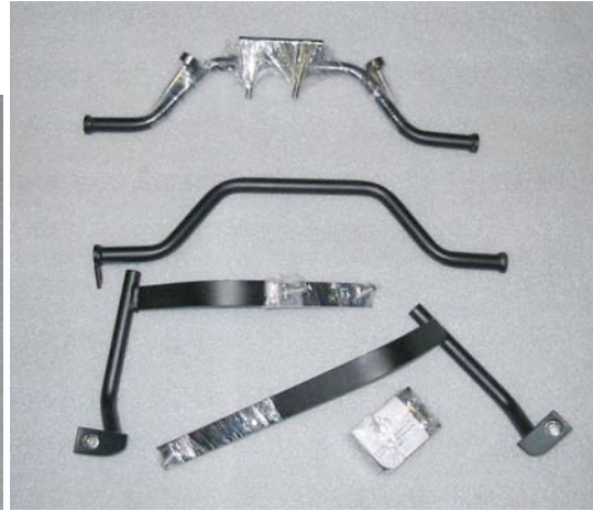
Figure 2. Mounts